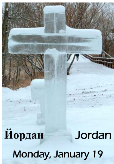
Йордан Jordan Monday, January 19

Our feasts and customs are no excuse for us to avoid keeping watch for the coming of the Saviour; the vigilance we observe now is the vigilance with which we will welcome Him when He comes again in glory.